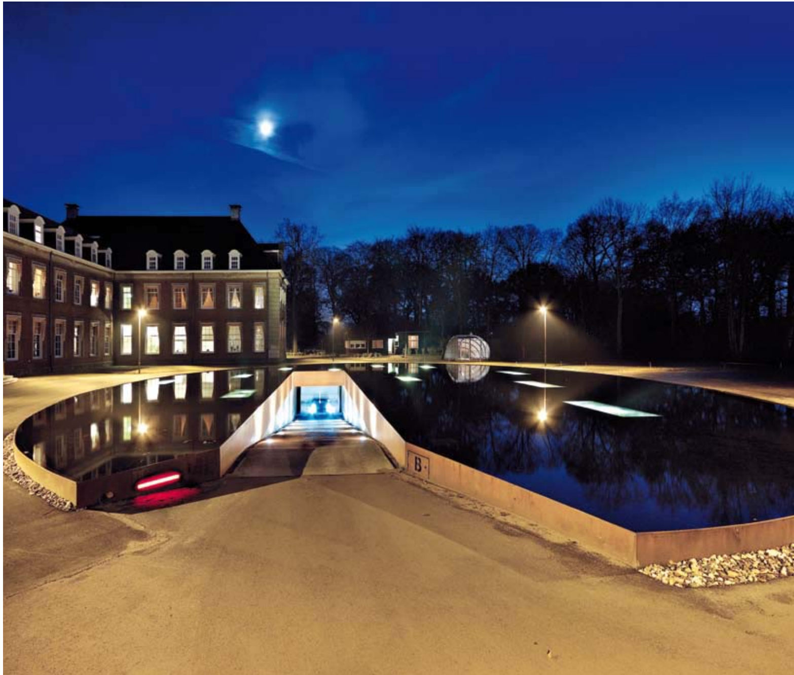
↑ | Entrance to underground car park, night view → | Entrance ramp, surrounding water reflects building

Address: Landgoed Hageveld, 2102 LN Heemstede, The Netherlands. Planning partners: MYJ groep architecten. Client: Hopman Interheem. Completion: 2008. Main materials: concrete, corten steel. Setting: rural.