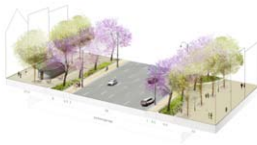
street profiel eastern section

Brussels is the city of Art Nouveau. The design of the pavilions, parking garage entrances, plant boxes and sofas gives a new, contemporary interpretation to the main style features (solid lines, flowing material transitions).