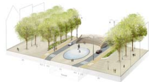
street profile middle section