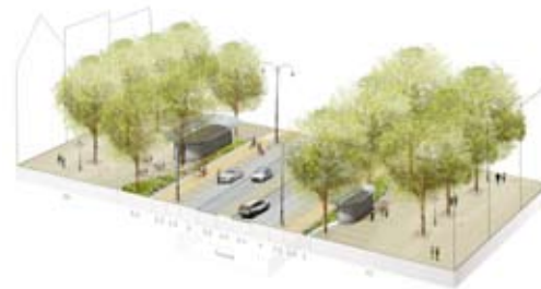
street profile western section