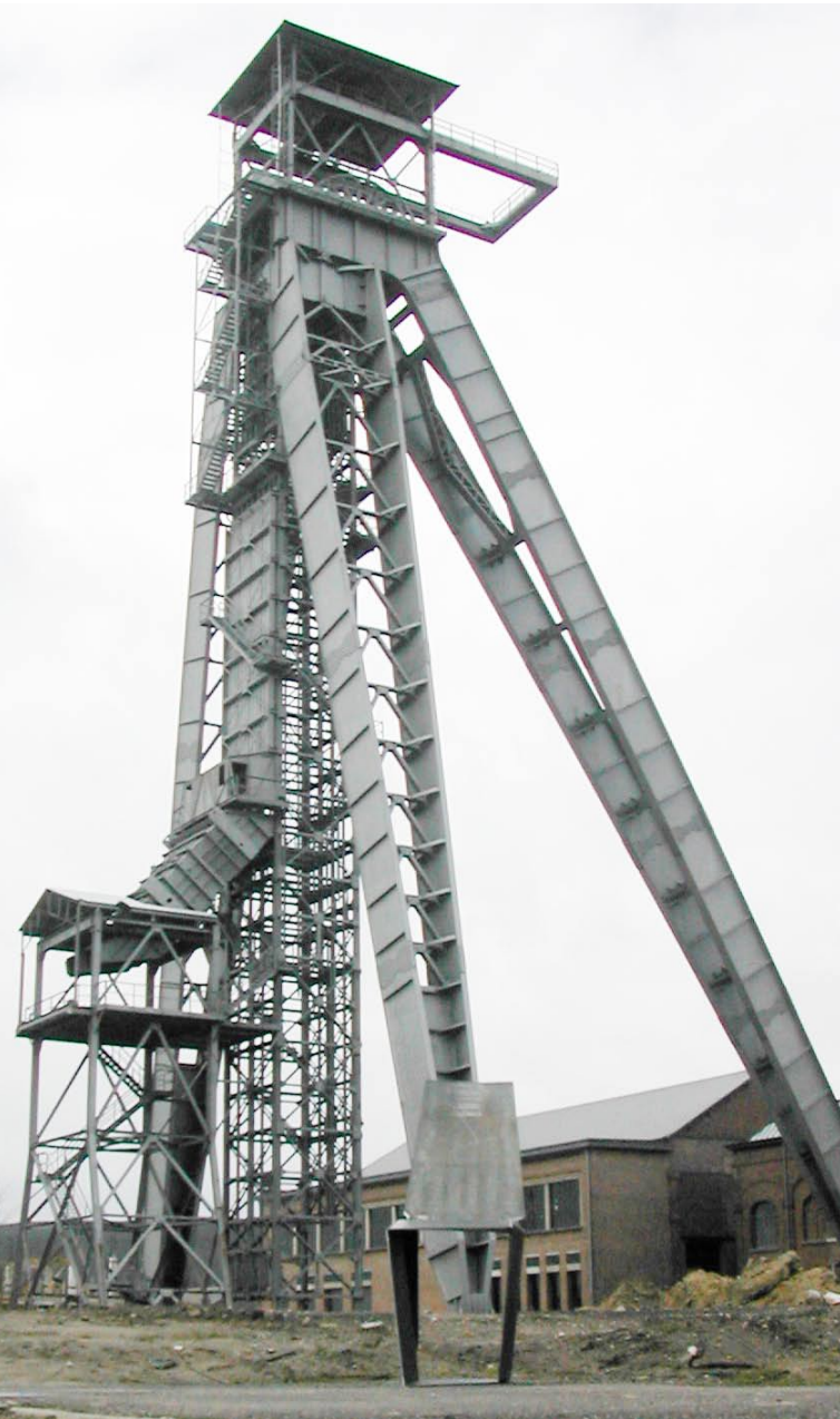
steel prototype on location