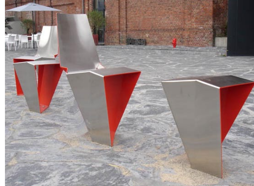
Single Scatter furniture on C-Mine square in Genk