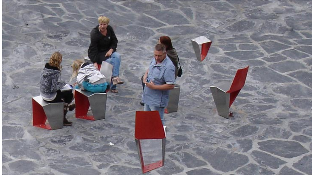
Single Scatter furniture

The C-mine leisure zone, situated on the site of a former coal mine, is the central open space in the new cultural heart of Genk. This urban open space is intended for a wide range of cultural and recreational activities. The former mine buildings round the square have been renovated to serve a variety of cultural purposes: one is a theatre, for example, another is a cinema, and there are several restaurants. The mine's old headframes also play a key role in the new set-up. NU architectuuratelier from Ghent designed an attractive route through the old mine galleries under the square, ending in a fantastic