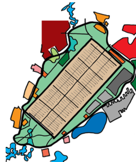
polder grid and divergent rim

The Framework serves as the basis for the development of high-grade nature areas: the bank land creates a sturdy ecological corridor between the peat grasslands in the Province of Noord-Holland and the Green Heart. The sturdiness and cohesion of the Green - Blue Framework results in a ramified and appropriately-zoned system of recreational route structures. The variation in landscape and nature - from park-like and rural to natural - offers scope for a range of recreational forms, facilities and businesses.