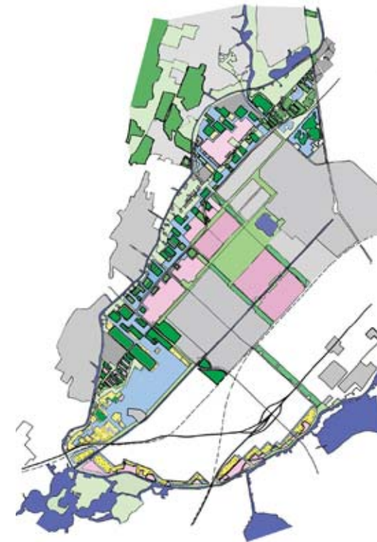
sketch green - blue framework