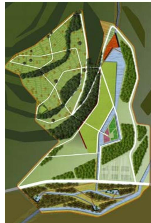
design for the first phase of the cemetery (2020), in the final phase this will form the entrance area for the cemetery