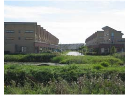
residential street at the park