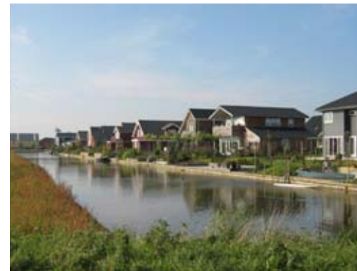
free plots Nauwe Greuns