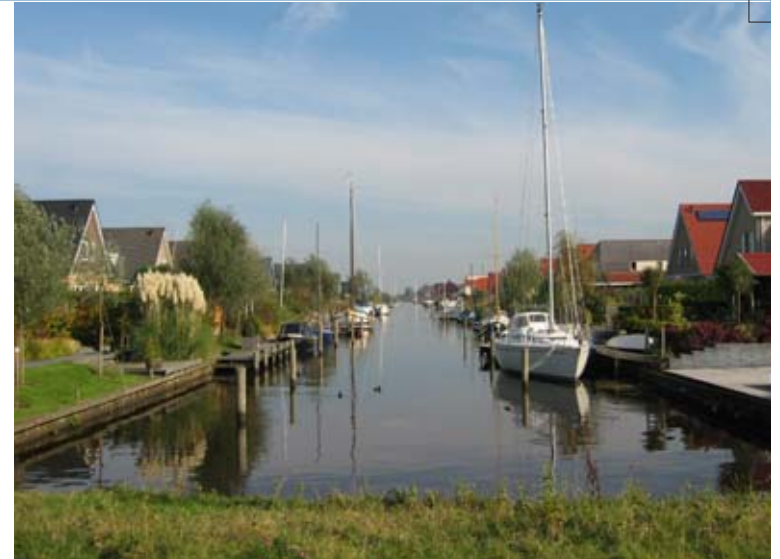
free plots Nauwe Greuns

that - together with the water area and the existing twin village - form an attractive entrance to Leeuwarden. The 'Blue Heart' in the third phase is a water-rich area with a programme of floating houses. The woodlands of 100 ha contain a number of modern estates.