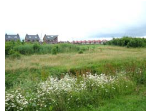
space in the residential landscape