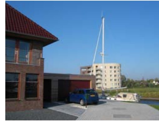
apartment building on the canal