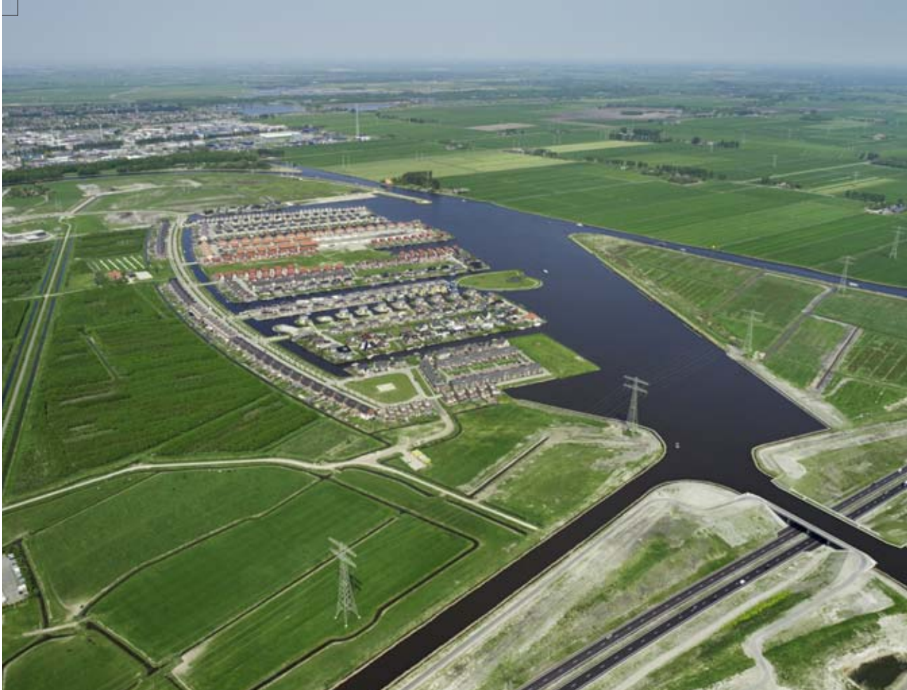
aerial picture 3rd phase