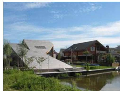
free plots part 3