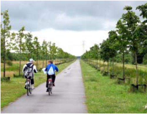
lane through the new forest