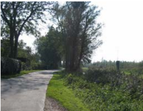
the new forest