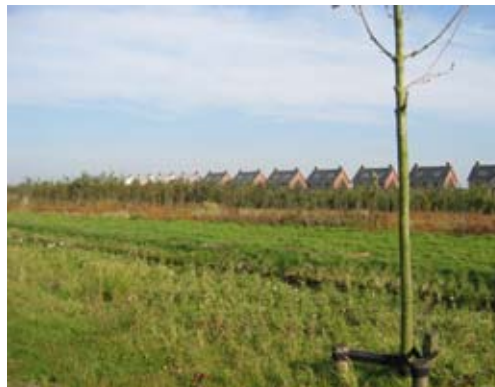
view of planarea 3