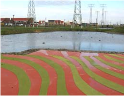
art in the park