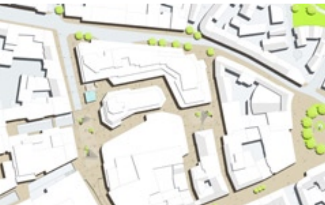
design of square

For the long term Hosper and Foundation 5+ suggest to demolish parts of the parking deck in order to restore the original street pattern. The Königstraße, once an important shopping street and now a dark, covered parking street, is the shining example of that strategy. At the place where the deck is removed, a staircase makes a beautiful edge to the Königstraße and at the same time provides access to the renewed Königsplatz.