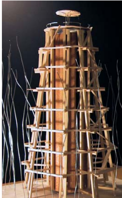
proposal look-out post 'tree tower'