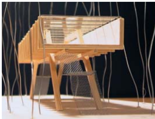
connective building across the N303