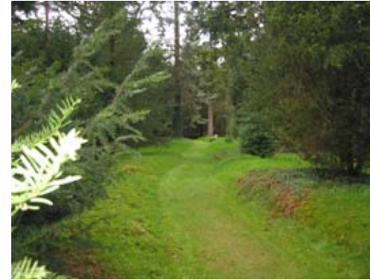
Pinetum Hidden Garden

HOSPER's winning plan revises the main spatial structure and reunites the two parts of the estate by building a tunnel beneath the busy Garderenseweg road that cuts through the estate. The plan also improves the situation at the entrance to the estate and creates more space for parking.