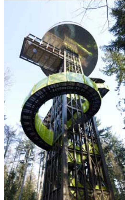
realised 'tree tower' (SeARCH, 2009)