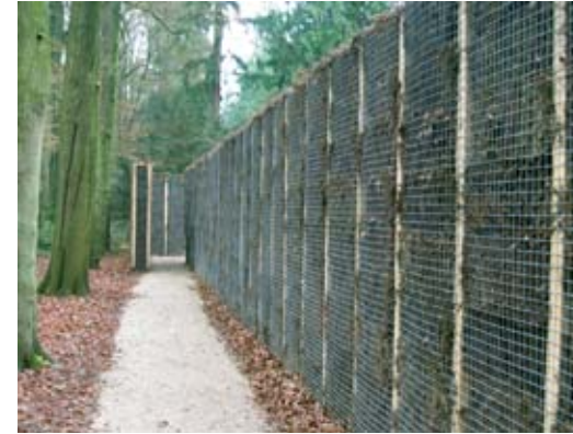
new green fence