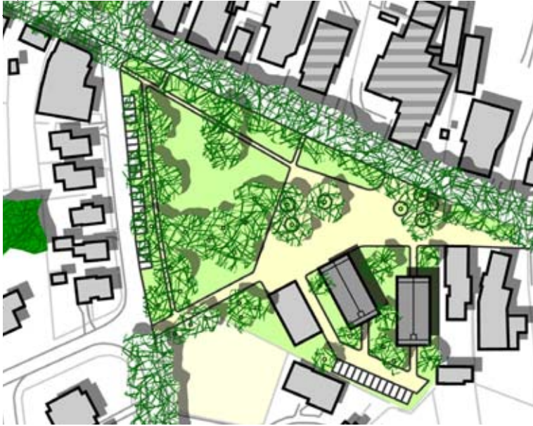
living in a village lively centre