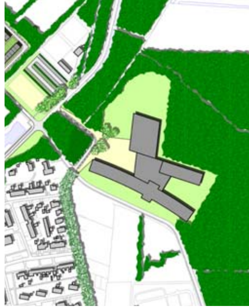
Community School centrally located in between childfriendly neighborhoods, sports fields, allotments and the Padenwood