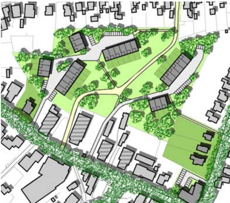
living on green "farmsteads"