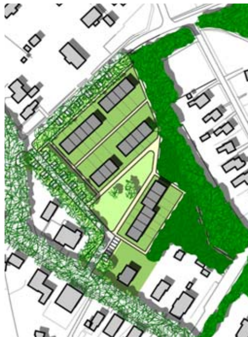
living green courtyard